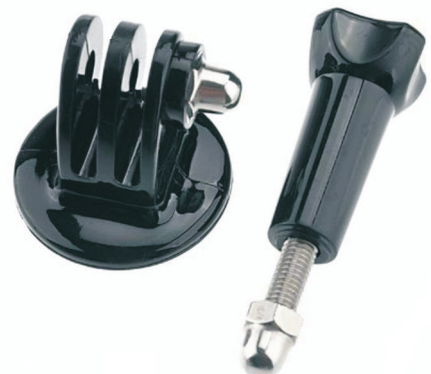
Tripod support with screw