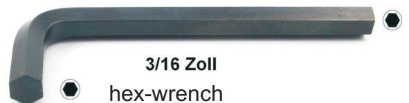
3/16 Zoll hex-wrench